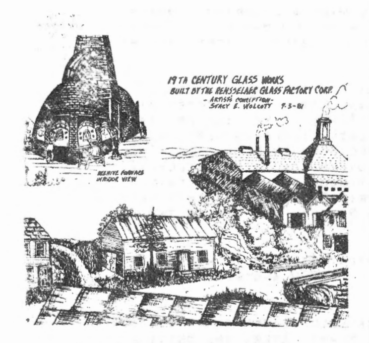
PEN & INK SKETCHES BY STACY E. WOLCOTT SEPT. 3, 1981

SAND LAKE HISTORICAL SOCIETY POST OFFICE BOX 492 WEST SAND LAKE, N. Y. 12196