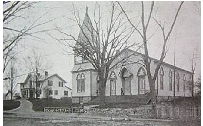
From a circa 1908 post card.