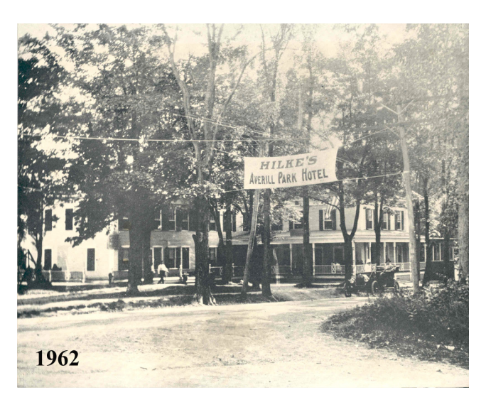
1962: Hilke's Averill Park Hotel . This picture can be compared to the two in the SAND LAKE book. On p. 53, it was Scram's Collegiate Institute; p. 46 shows it when Horatio Averill converted it into the hotel. It is now the site of the Church of the Covenant.