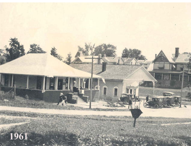
1961: The Trolley station for the Troy and New England Railway. Here is shown the station with the boarding houses on either side and the now "motorized" taxis ready to take the passengers to their desired destinations throughout Averill Park, Burden Lake, Sand Lake and Taborton. Both of the houses are still standing. The station was razed in 2004.