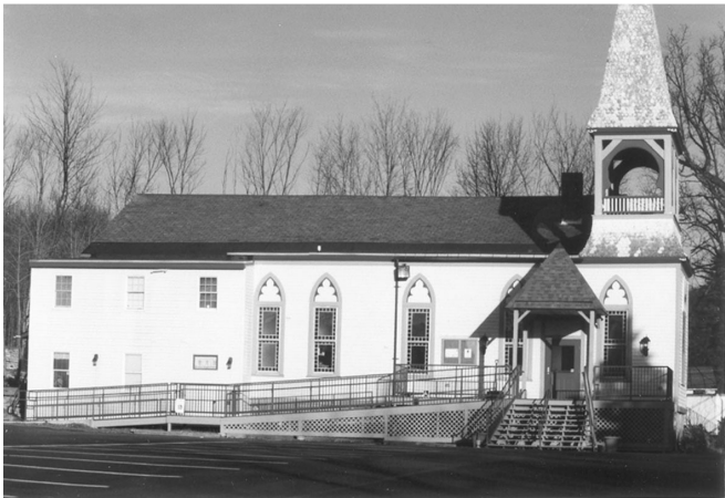
Sand Lake Center for the Arts. This building undergoes a magical transformation each time it's used.

Today the ghost or ghosts seem to have left, as no one hears them anymore or do they?