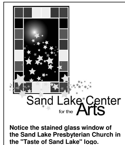
Notice the stained glass window of the Sand Lake Presbyterian Church in the "Taste of Sand Lake" logo.