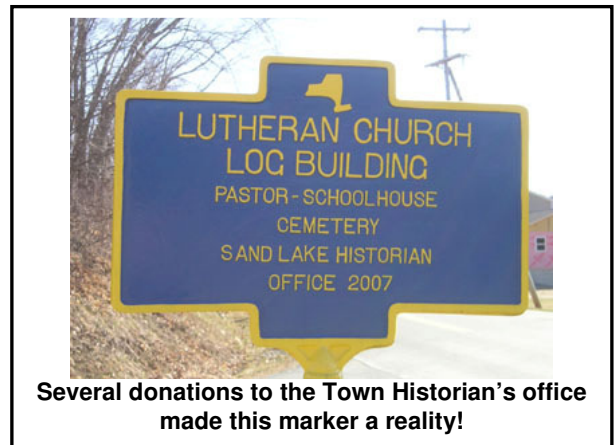
Several donations to the Town Historian’s office made this marker a reality!

An historical marker now designates the site of the first church building in the town. It was a log building serving as pastor’s home, schoolhouse and Lutheran