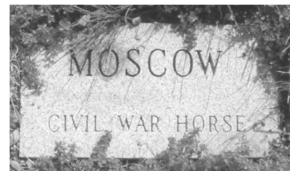
Gravestone of "Moscow, Civil War Horse"