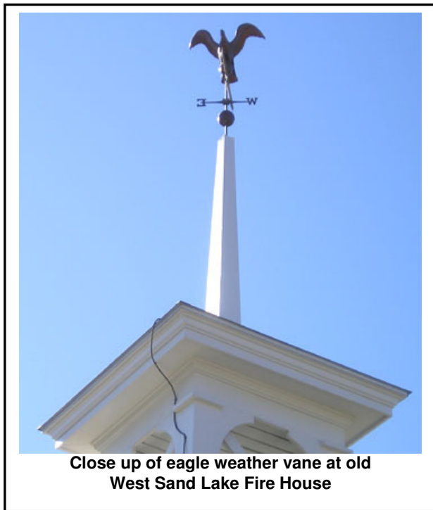
Close up of eagle weather vane at old West Sand Lake Fire House

made to look like the old doors with Old Joe and the hose cart on display.