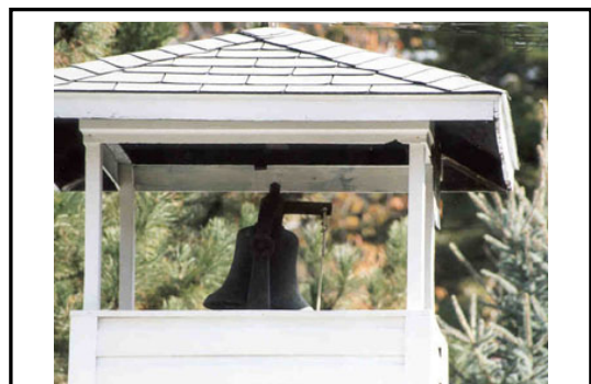
The cupola housing this bell has been restored: details inside!