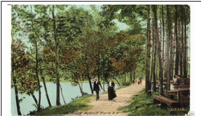
POST CARD: THE PINES, AVERILL PARK (ALONG CRYSTAL LAKE)

Averill Park, the eastern gateway leading to the Adirondacks, is the scene of much gayety now, due to the influx of summer visitors, who are flocking to the place from all quarters, particularly from this city. While since June the pretty village has contained a large crowd, the number of visitors was greatly increased on Saturday and Sunday, and by