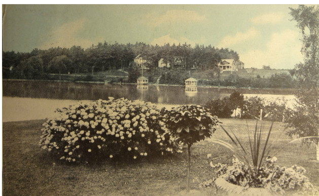
A VIEW LOOKING ACROSS CRYSTAL LAKE (FROM A 1920S POST CARD).