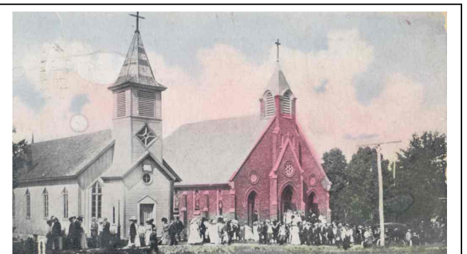
NEW AND OLD ST. HENRY'S CHURCHES.

At the park and around the borders of Crystal lake there are many beautiful summer homes and camps in which entertainment is found every day and night and where there is life and gayety at all times. As the visitor comes down the state road that branches off from the road up from the station, he comes to the handsome new St. Henry's church, and just south of it is the beautiful rectory of the