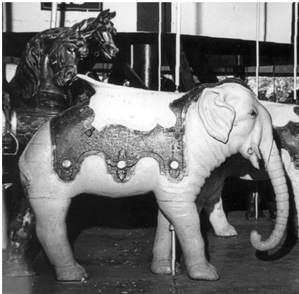
The elephant as it appeared when the carousel was at Crystal Lake.

the carousel was moved in 1908 to New Rensselaer Park in the Lansingburgh section of Troy. Advertised as a monster carousel, it remained there until the park closed in 1920.