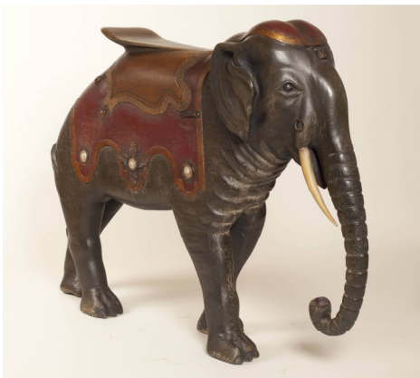
The restored carousel elephant that appears as part of the American Folk Art Museum exhibit A Shared Legacy: Folk Art in America in NYC.

history. From the Fall 2009 article: The Louis Bopp-Charles Looff-manufactured carousel began its life in the 1890s at Sulzer's Harlem River Park, New York City. Following the refurbishing and conversion of the stationary carousel, to include jumpers on alternating 2 nd and 3 rd rows,